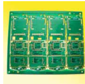
Shenzhen Sun & Lynn offers a six-layer lead-free PCB

Note: All price quotes in this report are in US dollars unless otherwise specified. FOB prices were provided by the companies interviewed only as reference prices at the time of interview and may have changed.